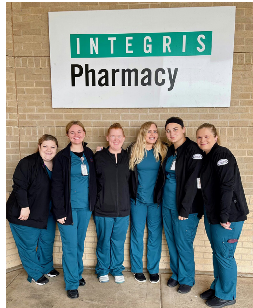
2021 Practical Nursing Class at a clinical site.

The Practical Nursing program is an 11-month course which includes both clinical hands-on instruction and classroom lecture work. NWTC's program has received approval from the Oklahoma Board of Nursing and has two highly qualified and experienced instructors. Students who complete the program will be prepared to take the national licensure examination.