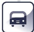
Transportation, Distribution, and Logistics