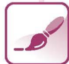
Arts, AV Technology, and Communications