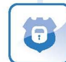
Law, Public Safety, Corrections, and Security