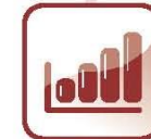
Business Management and Administration