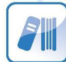
Education and Training