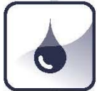
Agriculture, Food, and Natural Resources